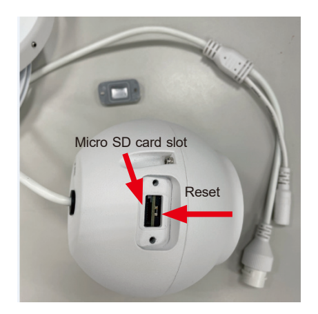
Figure 5-3: Reset Button and micro SD card slot of ICA-M4580P