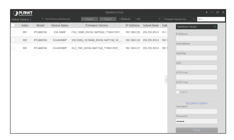
Figure 4-2: PLANET Search Tools Utility Screen

9. Without DHCP server, the ICA-x80 series default IP address is 192.168.0.20 , then the manager PC should be set to 192.168.0.x (where x is a number between 1 and 254, except 20), and the default subnet mask is 255.255.255.0.