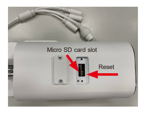
Figure 5-2: Reset button and micro SD card slot of ICA-M3580P