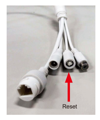
Figure 5-1: Reset Button

To reset the network type to the default "DHCP Client" with IP address "192.168.0.20" or reset the login password to default value, press the hardware-based reset button for about 10 seconds. After the ICA-x80 series is rebooted, you can log in the management Web interface within the factory default mode.