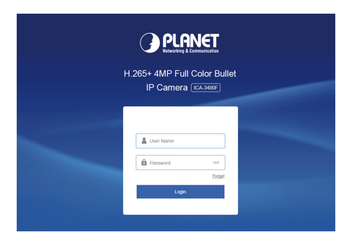
Figure 4-3: ICA-x80 series Web Login Screen

Default Username: admin Default Password: admin